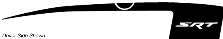
Driver Side Shown